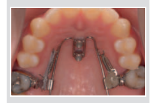
after 10 months